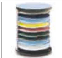
Storage rack for your consumables