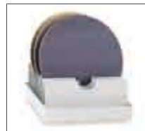
Draining for plates storage