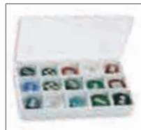
Specimen storage box